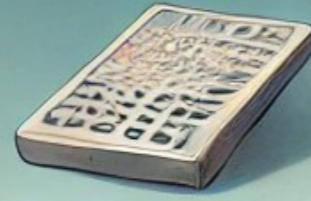
Surface mapping geologic studies