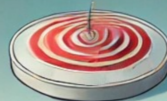
Surface mapping ground emanometry