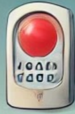
Non-Invasive geoelectric activities

Site Activities - Representation of prospecting activities and not an exact depiction. (FOR ILLUSTRATION PURPOSES ONLY)